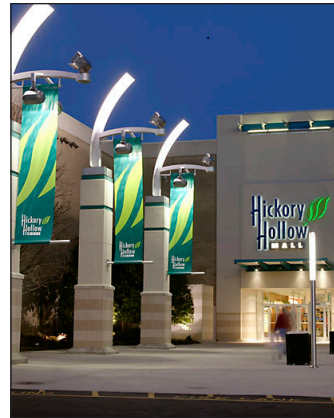
Hickory Hollow Mall