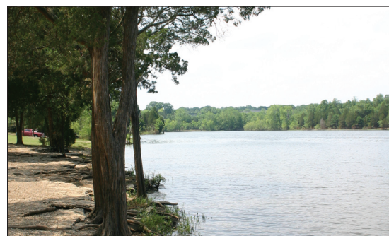
J. Percy Priest Lake